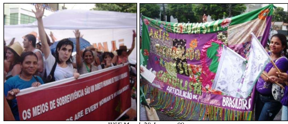
WSF March 28 January 09